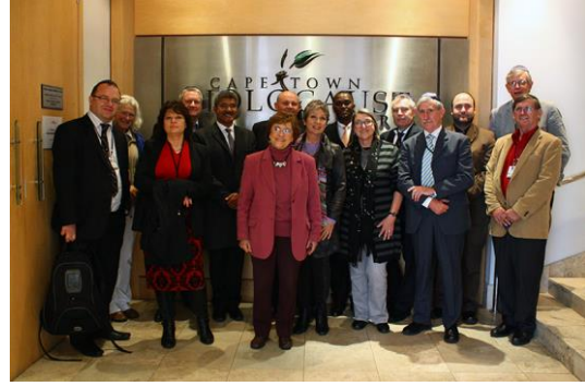
Members of Parliament after a guided tour through the permanent exhibition