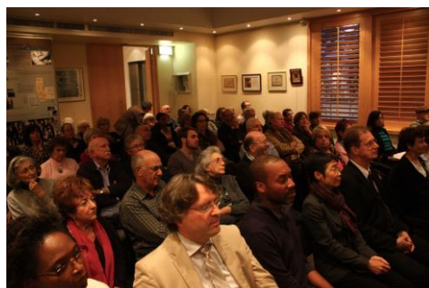
Gert Schramm & the Fate of Black People in Nazi Germany , by Alona Timkaeva