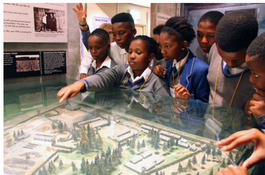
"I thought about today's programme as the most important exhibition I have ever experienced." Grade 9 learner, Sinenjongo High School