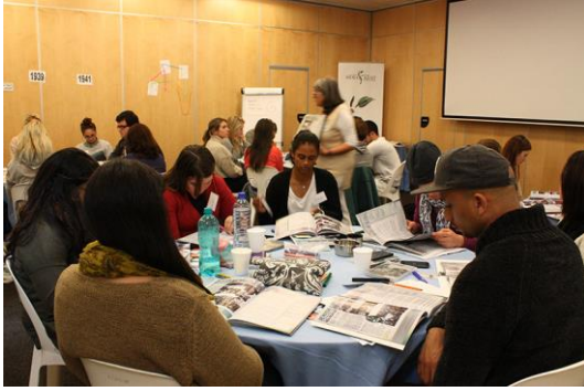
"A valuable learning experience that opened my eyes to how I can effectively teach this very difficult history." Student, Stellenbosch PGCE