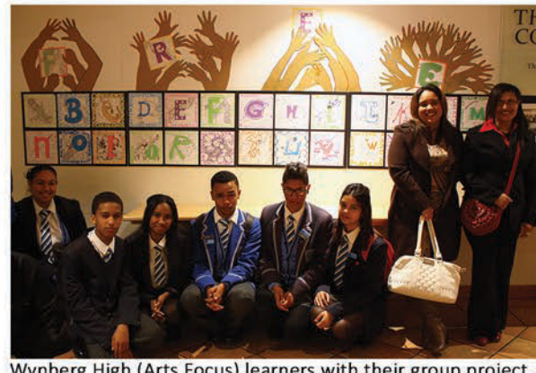
Wynberg High (Arts Focus) learners with their group project.